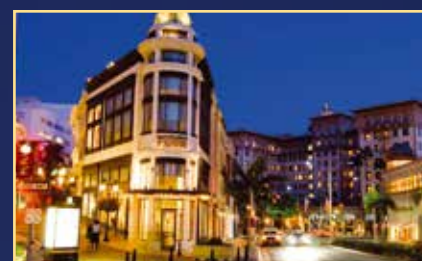
Beverly Hills Rodeo Drive