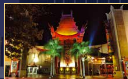
Chinese Theatre on Hollywood Boulevard