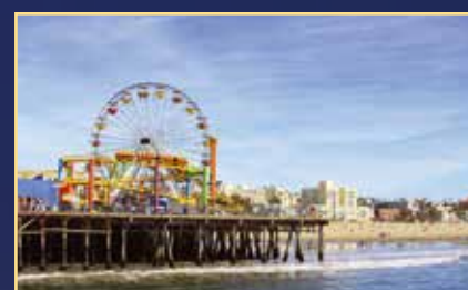
Santa Monica Pier